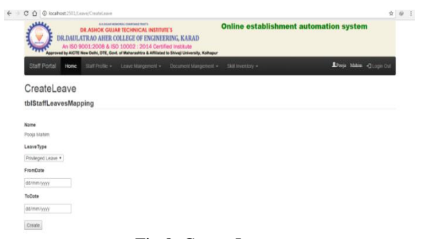
Fig 8. Create Leave

Fig. shows the all staff information but this option is accessible to only registrar and HoD, Principal.