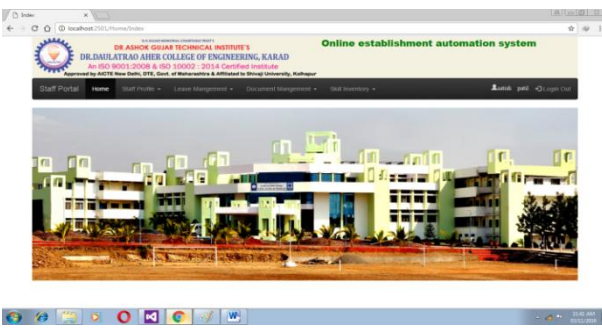
Fig 5. Home Page

Above Fig. shows the login page which will contain Login ID and password window. After user login he/she goes to the home page.