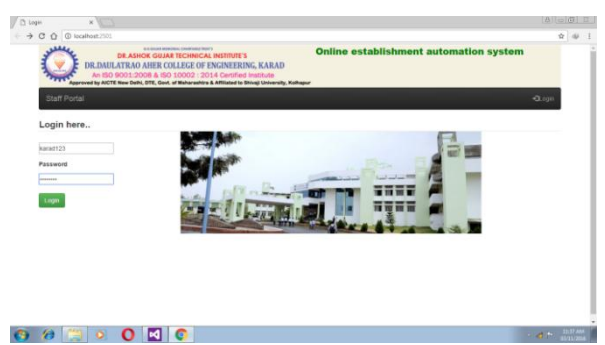
Fig 4. Login Page

Above Fig. shows the login page which will contain Login ID and password window. After user login he/she goes to the home page.