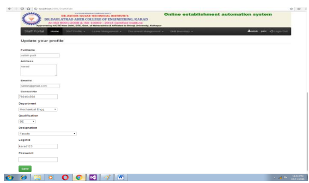
Fig 6.Update Your Profile option

Above Fig. shows the home page of the Online Establishment Automation system