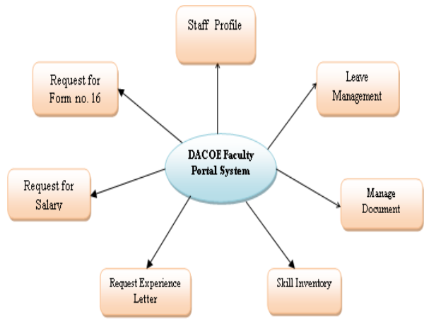
Fig.1. Architecture of the Online Establishment Automation System

The online establishment automation system consist of the main seven modules which are the Leave management, staff profile, Manage document, Skill inventory, request for experience letter, request for salary certificate, request for form no.16.