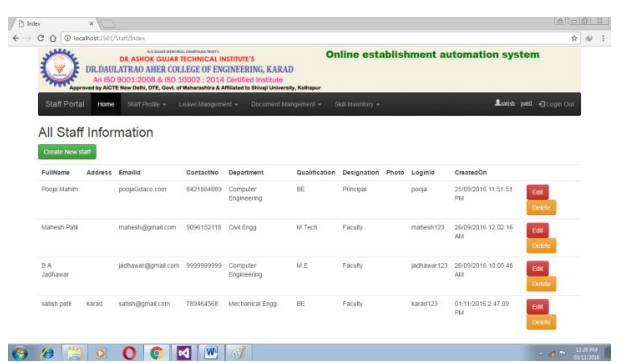
Fig 7.All Staff Information

Above Fig. shows that the system will provide the facility to every user that to Update own profile.